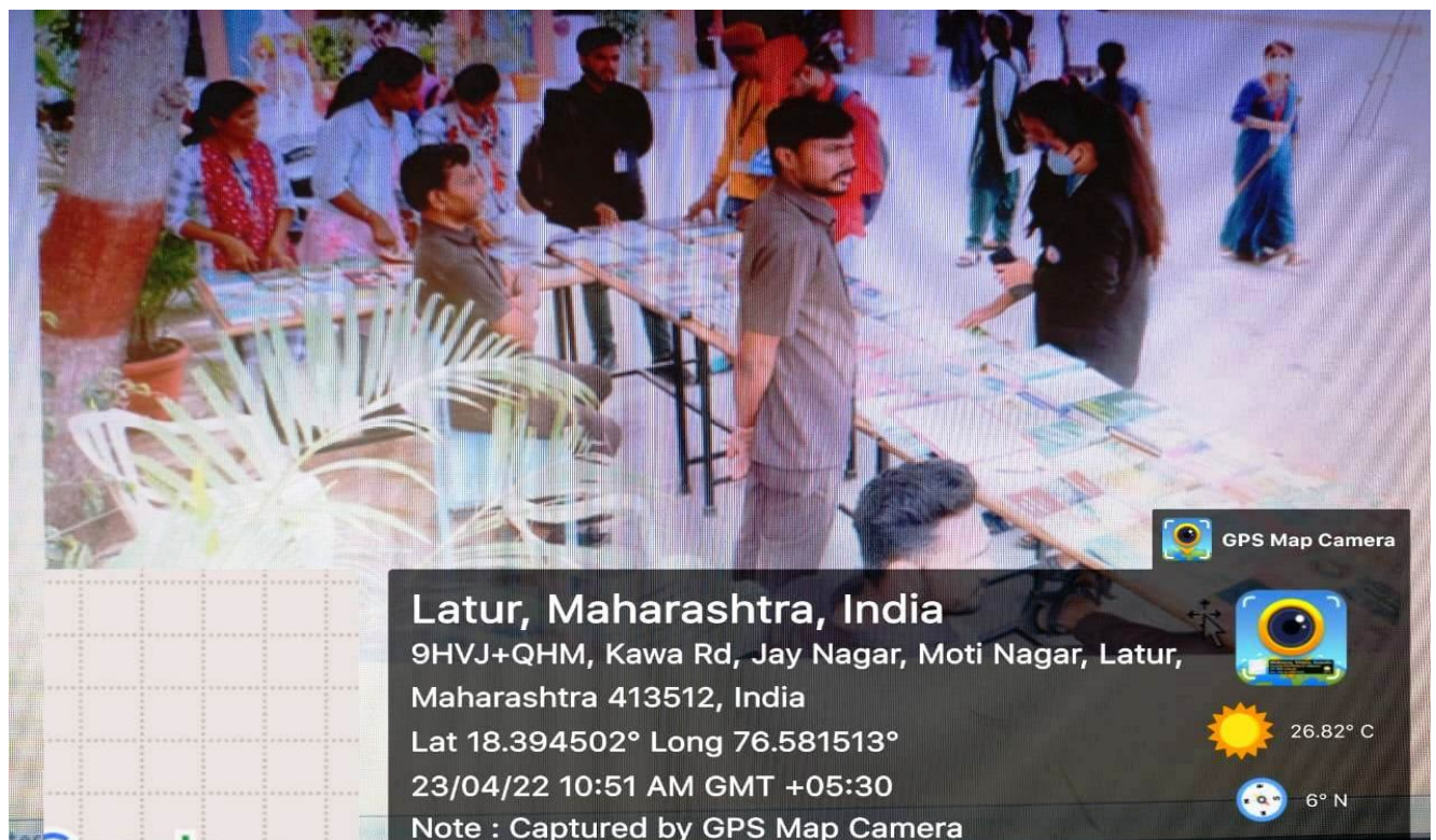
Students & non-teaching staff participated in books exhibition of world book day & copyright day