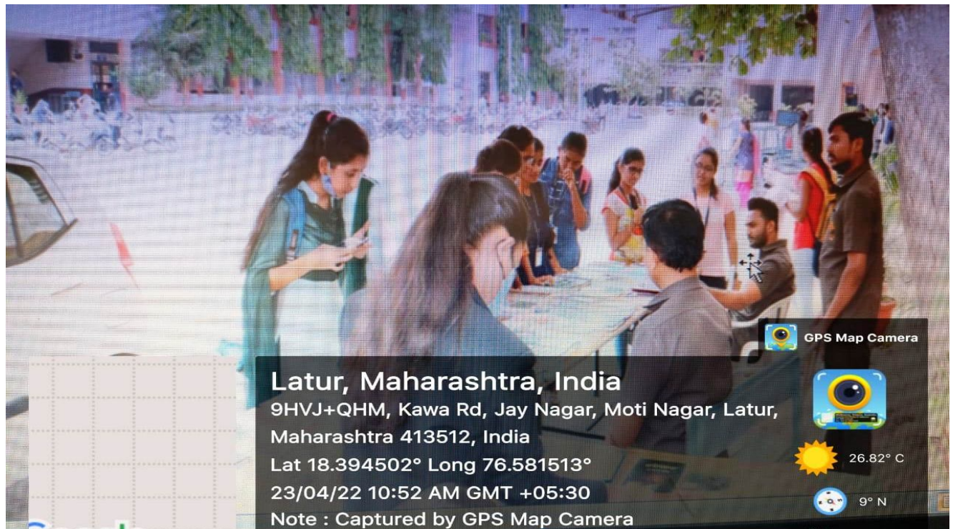
Students & non-teaching staff participated in books exhibition of world book day & copyright day